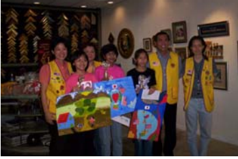
Jointly organised with the Arts & Craft Guild of KL & Selangor, the Lions KL Bangsar Peace Poster contest was held at Aoyama Gallery, Sri Hartamas (Pic) Winners with Bangsar Lions