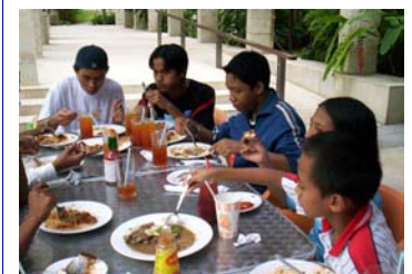
Tucking in to a scrumptious lunch cooked by renowned Chef Azizan Murad